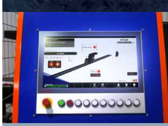
■ EASY-TO-USE GRAPHIC INTERFACE