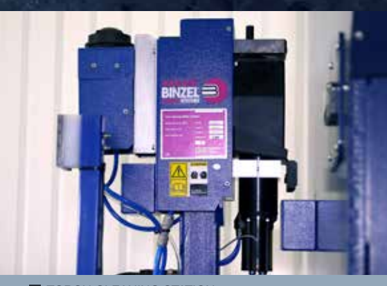
■ TORCH CLEANING STATION