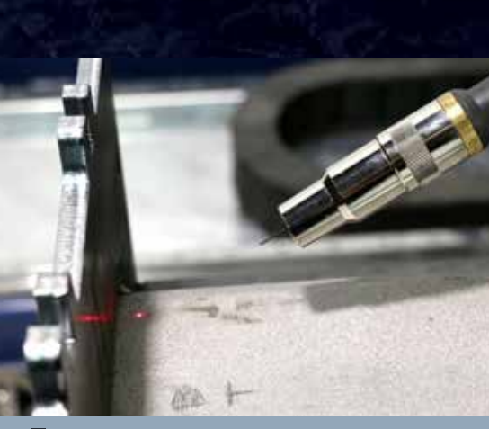
■ LASER TOUCH SENSING OF PART TO BE WELDED